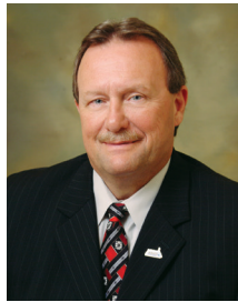
Hon. Bill Strickland