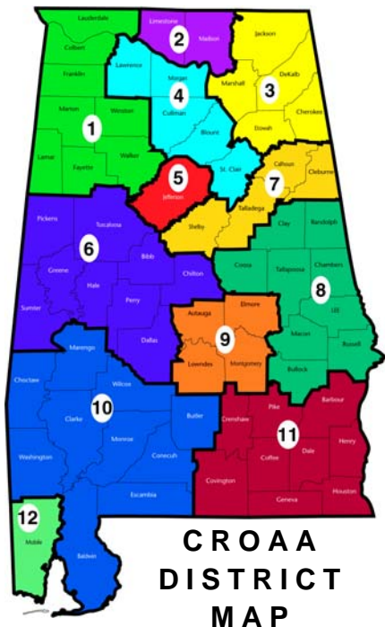
CROAA DISTRICT MAP

The strength of CROAA is its membership. If you are interested in becoming a member of CROAA, you must be employed in county government or be an individual who administers tax or license operations on behalf of a county taking jurisdiction. Membership dues are only $10 per year for Regular Members and Associate Members. The CROAA membership year is October - September. A membership application is available on the back panel of this brochure and can also be found on the CROAA affiliates page at www.alabamacounties.org .