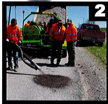
Inject Emulsion Aggregate Mixture