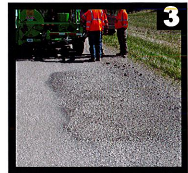
Cover With Dry Aggregate

The Free Travel Boom System Has a Working Radius of 18 Feet.