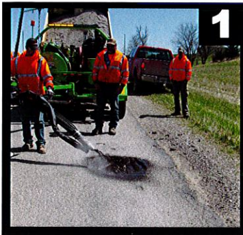
Apply Tack Coat